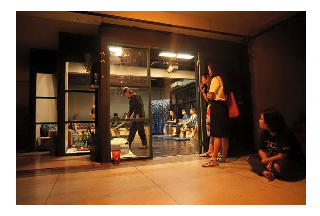
*This picture is of "Between".

When I saw his latest work "Between", I felt the message "People cannot connect," so his words were truly unexpected. Yet, the "connection" he is hoping for is surely much deeper down. The connection between people who appear to have no connection on the surface. That is not something you can see, but might be something you can feel.