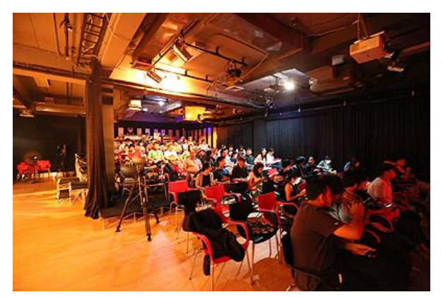
*This picture is inside the Creative Industries theater. It has a capacity of 80 to 100 people.

Just as Peach said, the atmosphere of this theater is more stylish than that of the Crescent Moon Theatre, the B-Floor Theater, or Democrazy Studio, and I could tell that they want to bring in a lot of regular people.